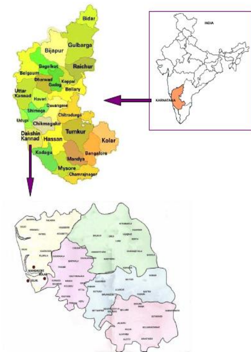
Figure 1: Map of Karnataka showing the study area