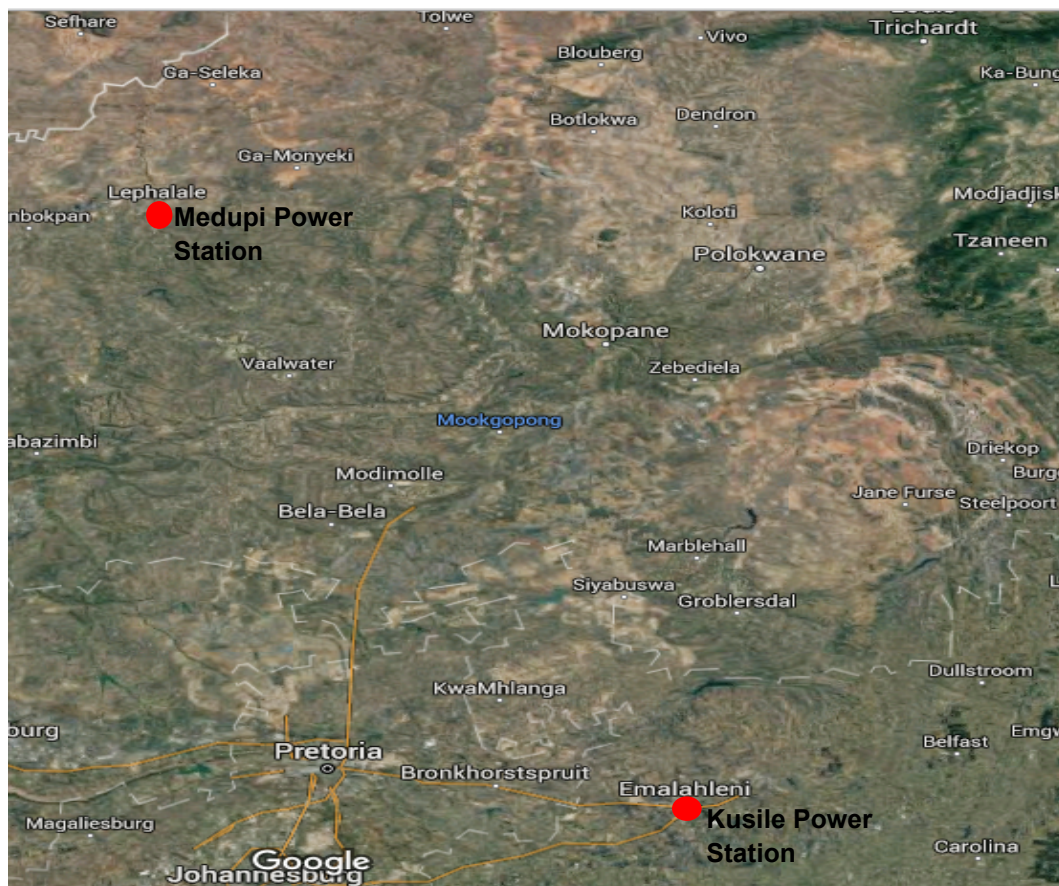
Figure 1: Kusile and Medupi Power Station location [26].