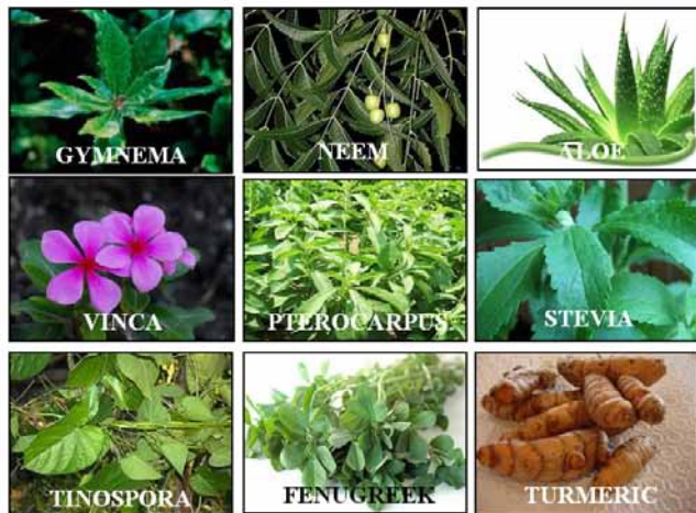
Figure 2: Some important plants possessing potential anti-diabetic activity.

synthetic/semisynthetic analogues [10]. According to WHO more than one million people rely on herbal medicines to some extents [11]. Traditional literatures like Charak Samhita already report the use of plants, herbs and their derivatives for treatment of diabetes mellitus [12]. In recent years FDA (Food and Drug Administration) and EMEA (European Medicines Agency) have shown keen interest in reviewing the regulatory frameworks governing the development and use of botanical drugs. This keen interest has provided a significant fillip to the natural products industry and has significantly lowered the entry barriers for botanicals and related products. These new guidelines more importantly also provide guarantees of market exclusivity for botanicals as well as the acceptance of synergistic combinations of plant derived bioactive products. The current review focuses on the