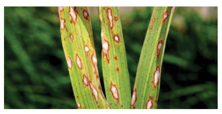
Figure 1: Symptoms of blast in leafs of rice plant (Photo Source: IRRI).

The teleomorphic stage of rice blast pathogen i.e. Magnaporthe grisea produce sexual spores asci within perithecia. The mycelium is septate and the nuclei within mycelium and spores of this fungus are haploid. The asexual stage of this fungus is called as Pyricularia oryzae which produce spore called conidia. Conidia are produced after several hours of high humidity on the center of lesion and released usually at night or early morning, especially under windy condition [25]. This disease is seed borne as well as air borne. Mycelium and conidia over-wintered on straw and seeds as well as on the collateral hosts like Eleusine coracana , E. indica , Panicum sp., Setaria sp. etc which serves as primary source of inoculums [13]. Secondary spread by wind borne conidia. Conidia land on