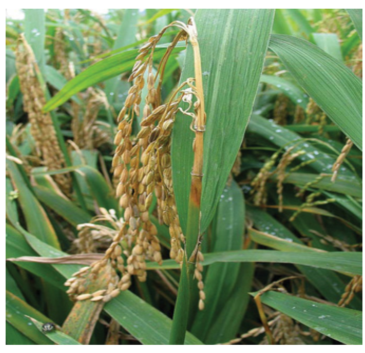
Figure 3: Symptoms of neck blast in Rice.

Cloudy weather, high relative humidity (93-99%), low night temperature between 15-20°C, longer duration of dew are the most favorable condition for the outbreak of blast fungus. Host nutrition also affects the infection by the pathogen as susceptibility increases with higher doses of nitrogen [29] as it encourage more vegetative growth during early stage and increase blast severity [30]. Whereas plants become resistant against the infection when silicon content increases as silica get localized in leaf surface which acts as a physical barrier against blast fungus penetration [31]. The disease is also severe in thick stands of rice or with light textured soil. It can survive also on unfavorable condition i.e., in seed and plant residues. Low rate of infection was observed in seedlings grown on wet bed whereas transmission of blast fungus was more on low temperature and grown with light or no covering of soil [32]. In