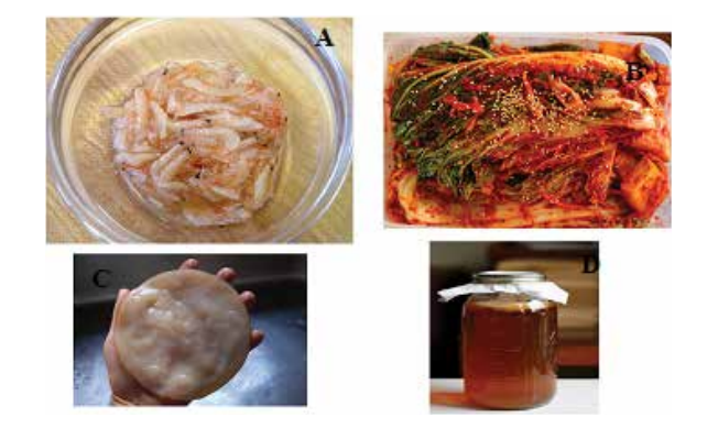
Figure 2: (A) Brine shrimp sauce (B) Kimchi (C) Scoby (D) Kombucha.