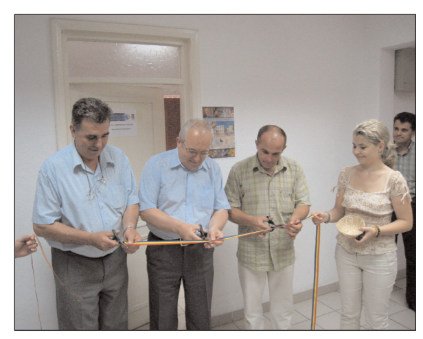
Figure 1. Opening of the Oral Health Cross-Border Centre for Research in Oral Health at the Faculty of Dental Medicine, Ovidius University, Constanta.

• The inauguration of the first "Cross-Border Centre for Research in Oral Health" within the Faculty of Dental Medicine, Ovidius University, Constanta ( Figure 1 ).