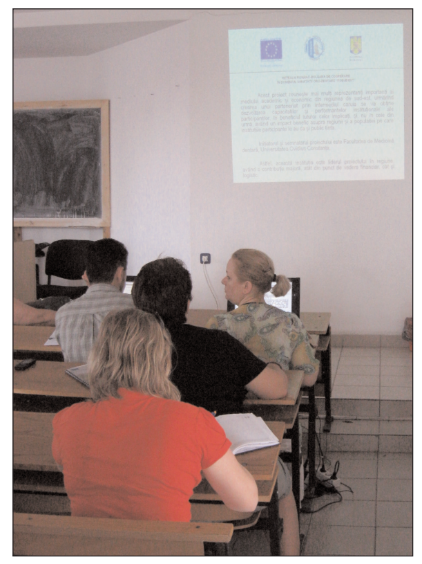
Figure 4. Participants in the "Oral Health: An Essential Factor for the Quality of Life" workshop.

• The organisation of seminars for professional training concerning oral health, the creation of the Oral Health Education brochure in both Bulgarian and Romanian, and the development of oral health promotion and free-of-charge consultations in the four counties within the project [10].