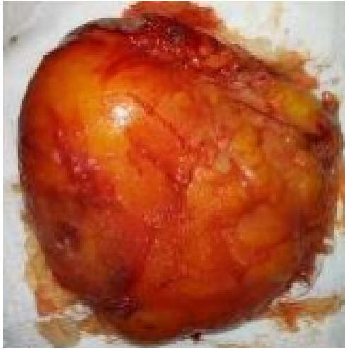
Figure 2. Macroscopic appearance of swelling after resection.

consistency with irregular edges and a rough surface, as shown in Figure 2 .