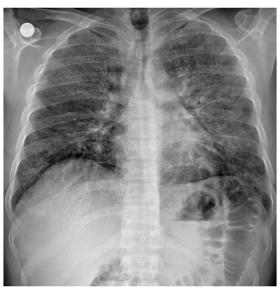
Figure 2: Chest radiography of the patient at admission.