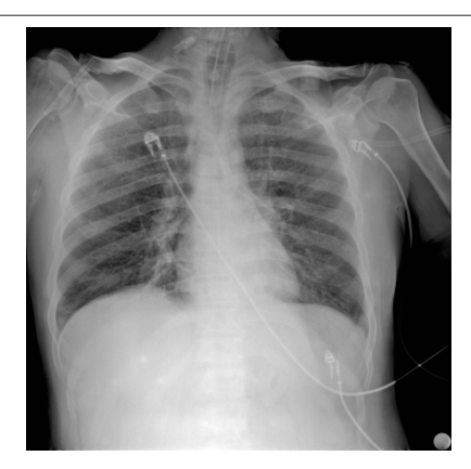
Figure 3: Chest radiography of the patient at 10th day.

It was started SARS-CoV-2 treatment regimen. Hydroxychloroquine was given 400 mg twice a day with a loading dose on the first day and then 200 mg twice a day, Favipiravir 600 mg twice a day after loading dose of 1600 mg twice a day and ceftriaxone 1 gr iv twice daily for one week.