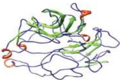
Figure 1: The final considered model from Modeller output (visualisation by Chimera).

Figures/ Images/ Graphs/ Table (both Color and BW) if any